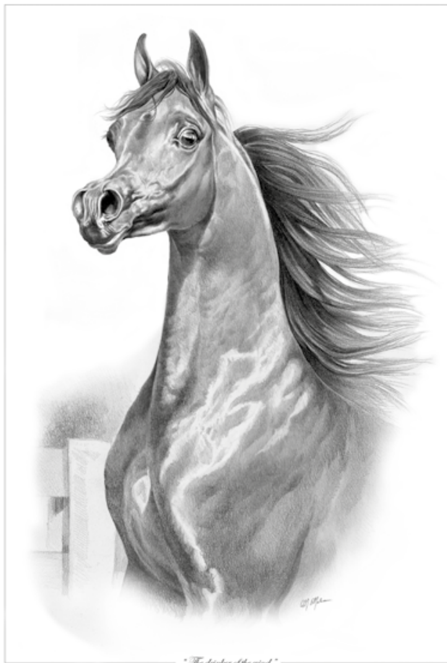
Arabian Trilogy "The drinker of the wind" Pencil - Print Size: H.cm. 70 x L.cm. 50