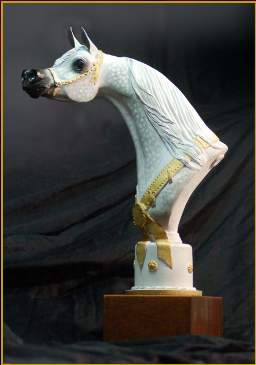
“The Best Head” Resin Trophy - Size: H.cm. 36 x L.cm. 21 x W.cm11