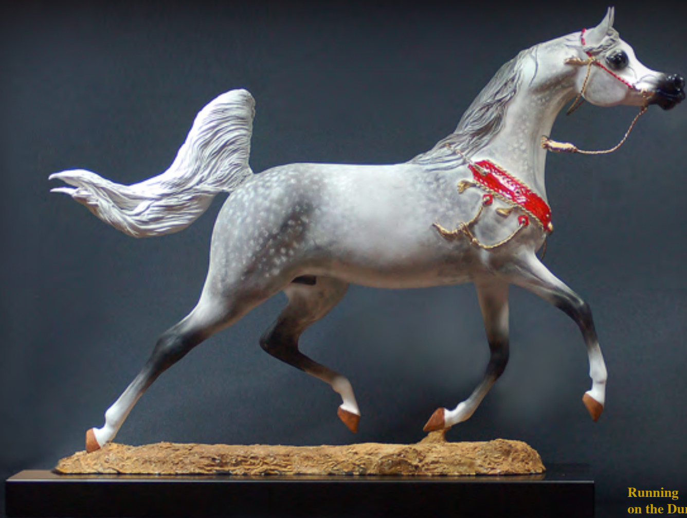
Running on the Dunes