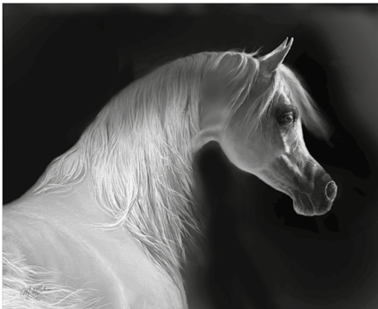
"Stallion in the Shadow"