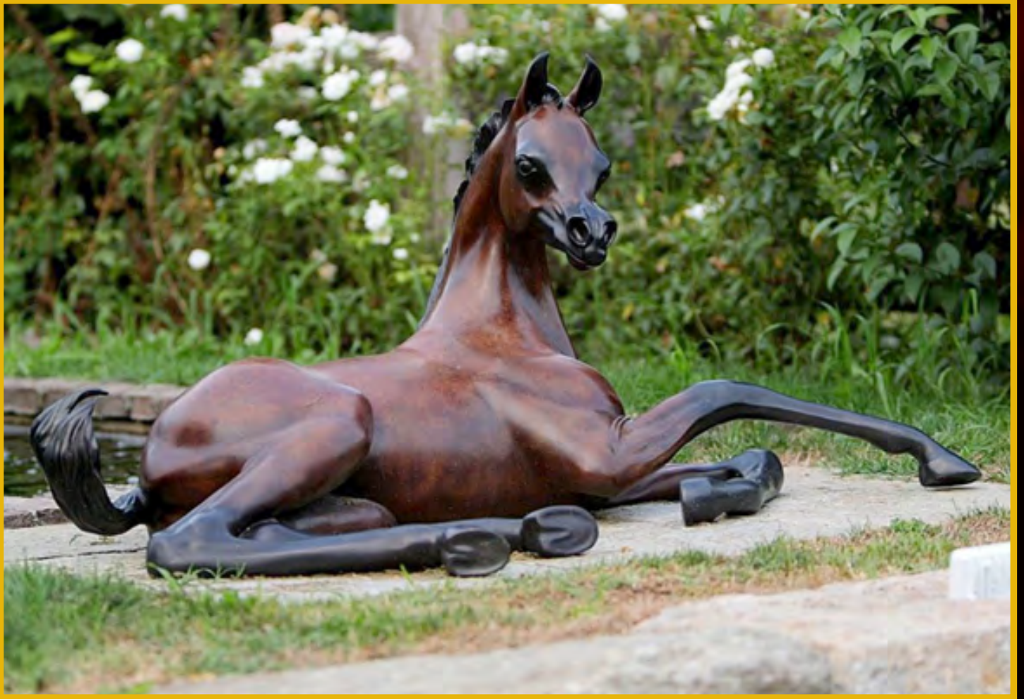
Arabian Trilogy "The drinker of the wind" Pencil - Print Size: H.cm. 70 x L.cm. 50